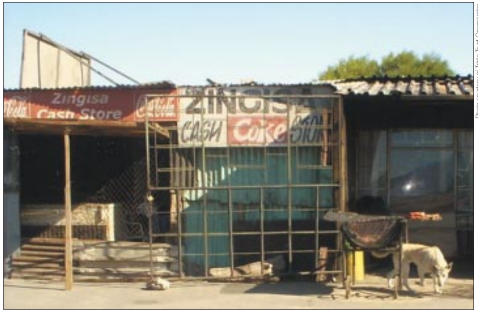
The Zingisa Cash Store in Cape Town's Khayelitsha township, home to 1 million residents, is typical of spaza shops—small, home-based convenience stores in Cape Town, South Africa.

What if you were able to pay for all goods delivered to your shop using a debit