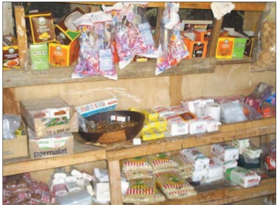
Rice, milk, tea, and other goods line the shelves behind the counter at a typical spaza shop. More than 3,600 spaza shops sell basic grocery items to low-income consumers in Cape Town townships.